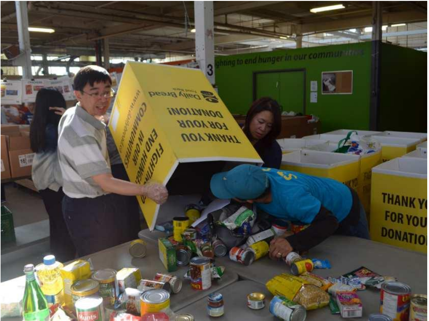
Workers unload a food box at Toronto's Daily Bread Food Bank.

By Heidi Westfield, Postmedia Content Works