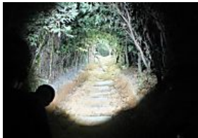
Brightest Flashlight Ever Now Available To Purchase Online Shadowhawk X800 Flashlight