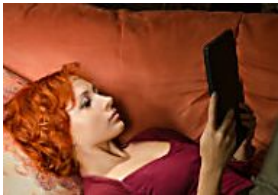
Read Ebooks? Here's The Worst Kept Secret Among Book Lovers BookBub