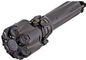
"Brightest Flashlight Ever" is Selling Like Crazy X800 Tactical Flashlight