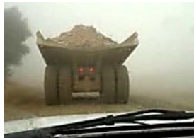
Watch What Happens When Road Rage Takes Over. Oops Holy Horsepower