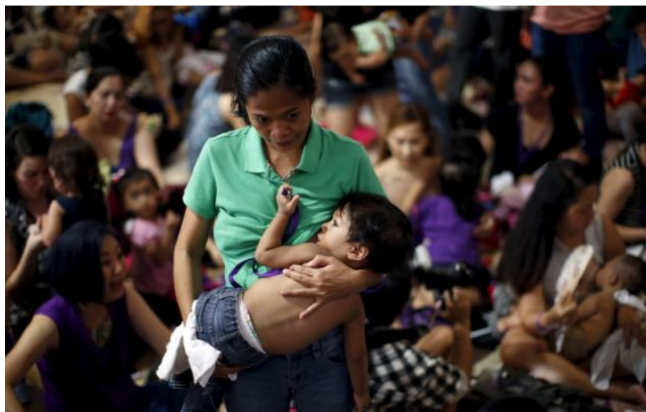
A mother breastfeeds her child in Mandaluyong city, Metro Manila in the Philippines August 1, 2015.