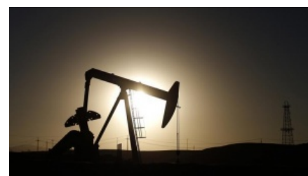
Mansion for sale and discount dining: oil rout hits Houston's rich

(Reuters Health) – Children who breastfeed, especially those living far from the equator, may get too little vitamin D, according to a new study in Canada.