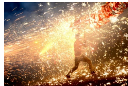
Our most compelling photos of the week. Slideshow »